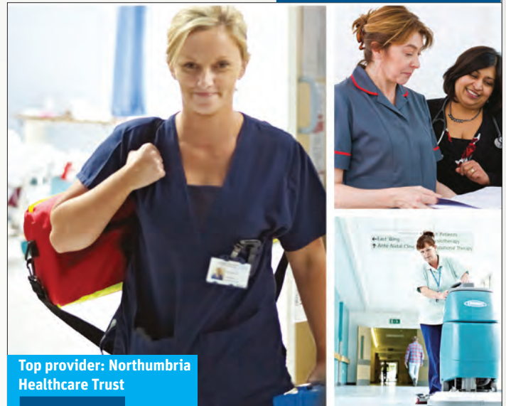
Top provider: Northumbria Healthcare Trust

Judges' comments This integrated trust has taken patient experience and quality measurement to a new level.