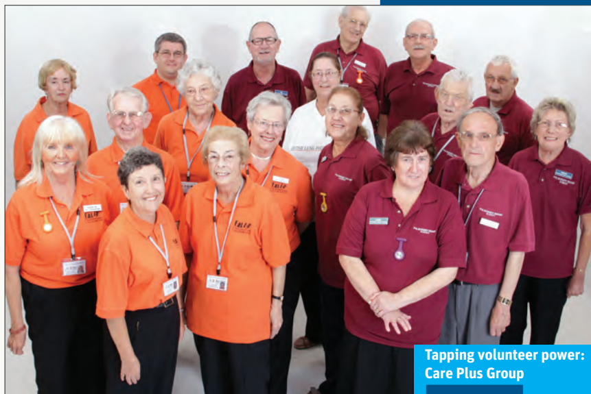
Tapping volunteer power: Care Plus Group

Judges' comments A standout example of empowerment, delivering high quality, social personalised care.