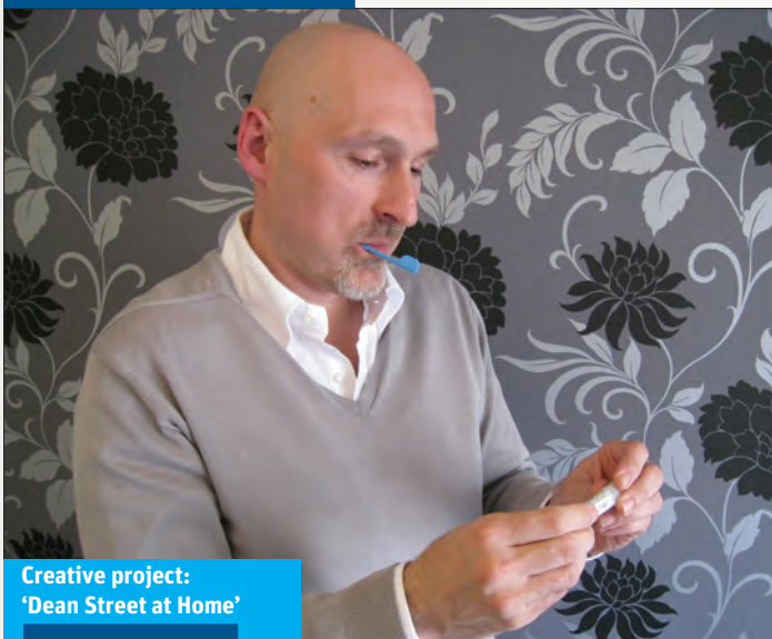
Creative project: 'Dean Street at Home'