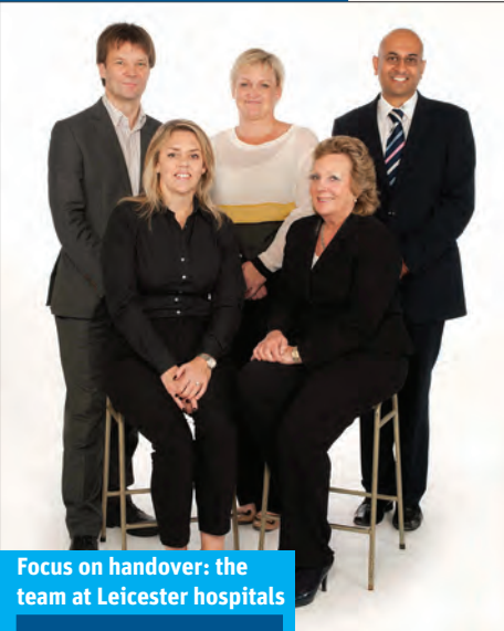
Focus on handover: the team at Leicester hospitals