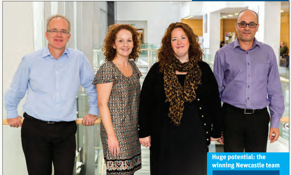
Huge potential: the winning Newcastle team

Judges' comments Potential for huge productivity savings across the NHS.