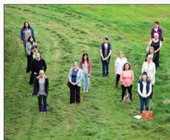
Wigan way: the winning team

Judges’ comments Clear connection being made between partnership and staff engagement, service delivery and quality of care.