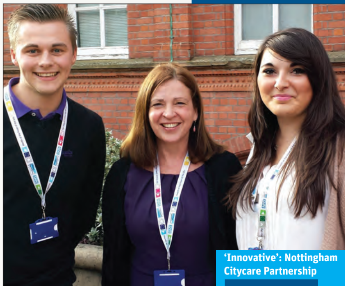
'Innovative': Nottingham Citycare Partnership

Judges' comments Demonstrated a strong case for making a difference in their community. A truly innovative approach to service delivery.