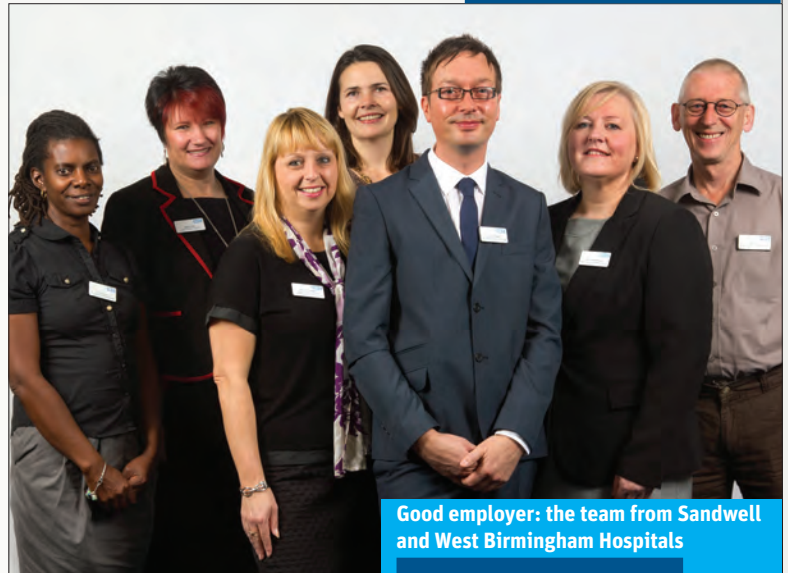
Good employer: the team from Sandwell and West Birmingham Hospitals

Judges' comments Recognising the role of the hospital as a large employer in the community and the impact of employment levels on health, offering new ways into employment and progression through a multi-agency partnership.