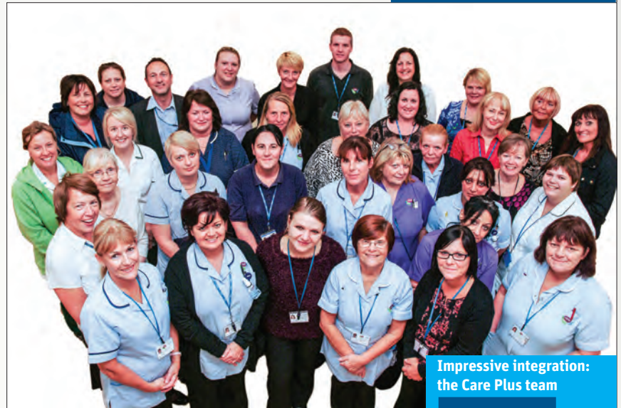
Impressive integration: the Care Plus team

Judges’ comments Very, very impressive example of integrated services and model of intermediate care delivered by social enterprises in a seamless fashion.