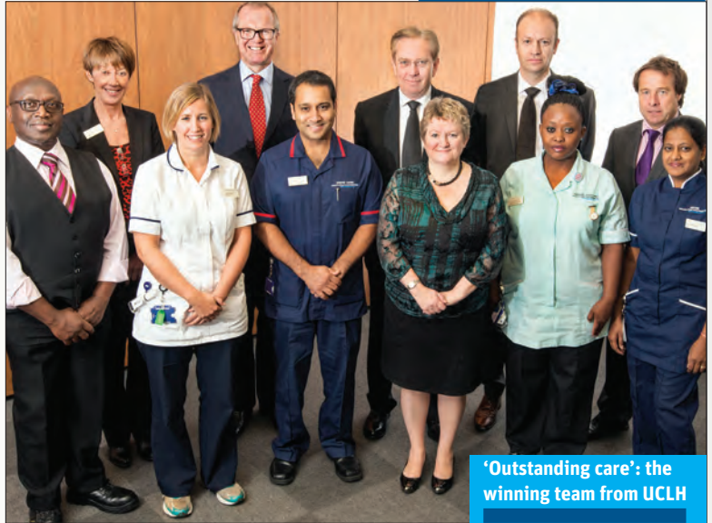
'Outstanding care': the winning team from UCLH

Judges' comments Excellent example of outstanding clinical leadership delivering outstanding patient care.