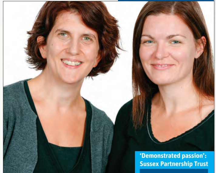
'Demonstrated passion': Sussex Partnership Trust

Judges' comments Demonstrated pride and passion in enabling patients to take part in research with the aim that "every patient is a research patient".