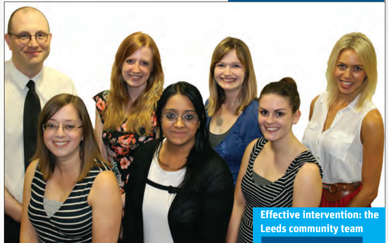
Effective intervention: the Leeds community team

Judges’ comments Simple and effective intervention to an under-recognised growing problem.