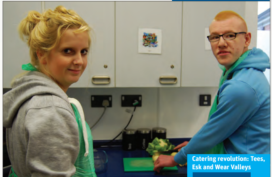
Catering revolution: Tees, Esk and Wear Valleys

Judges' comments A fantastic example of how staff and service users can change the culture of care provided.