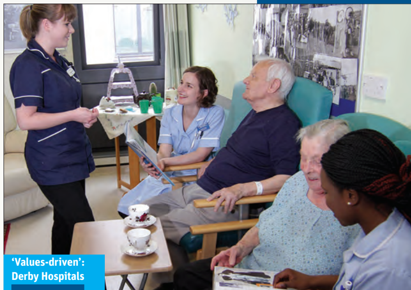
'Values-driven': Derby Hospitals

Judges' comments The intergenerational partnership is outstanding. A real values-driven approach demonstrated through a range of exciting innovations.