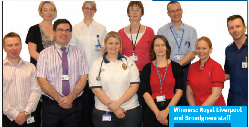
Winners: Royal Liverpool and Broadgreen staff

Judges' comments A nice example of taking agreed practice from one area and applying it somewhere else.