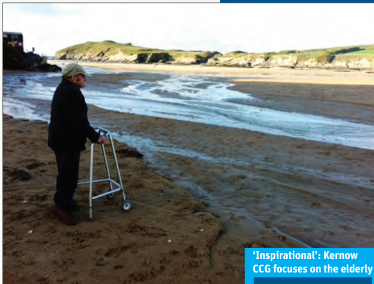
‘Inspirational’: Kernow CCG focuses on the elderly

Judges’ comments Inspirational and moving. We want to grow old in Cornwall.