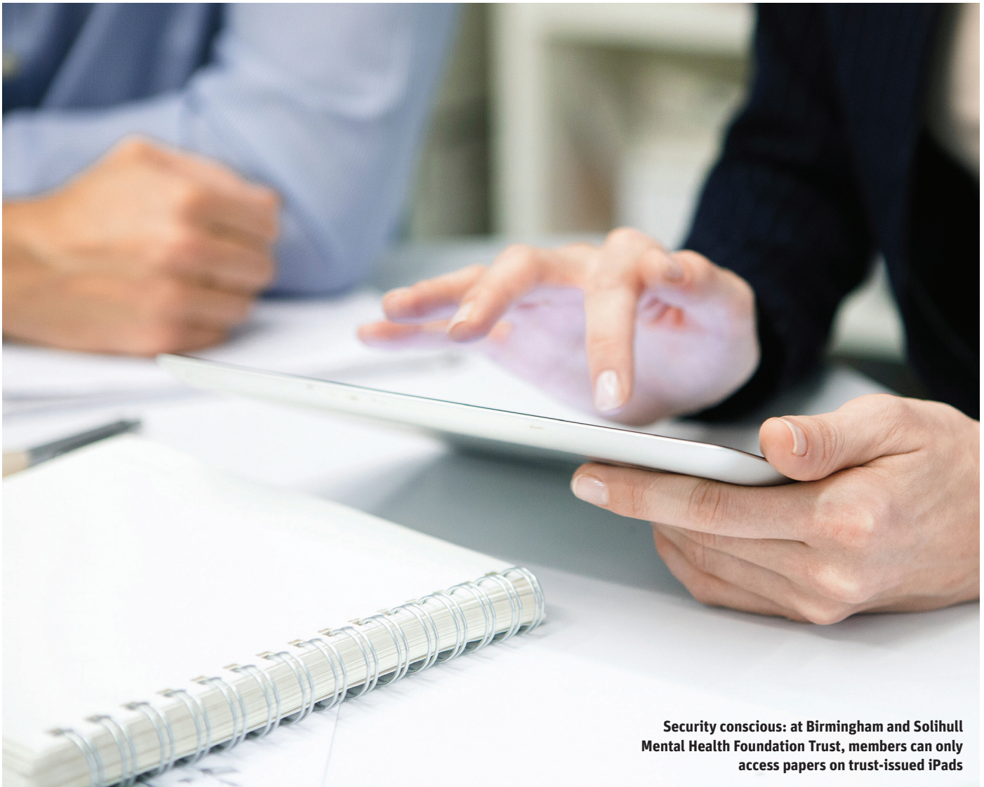
Security conscious: at Birmingham and Solihull Mental Health Foundation Trust, members can only access papers on trust-issued iPads

submission as it was being built up. Because it was on BoardPad, we were able to put the papers on there for the board to see what was happening as the submission was being worked up, and to be able to comment on it.