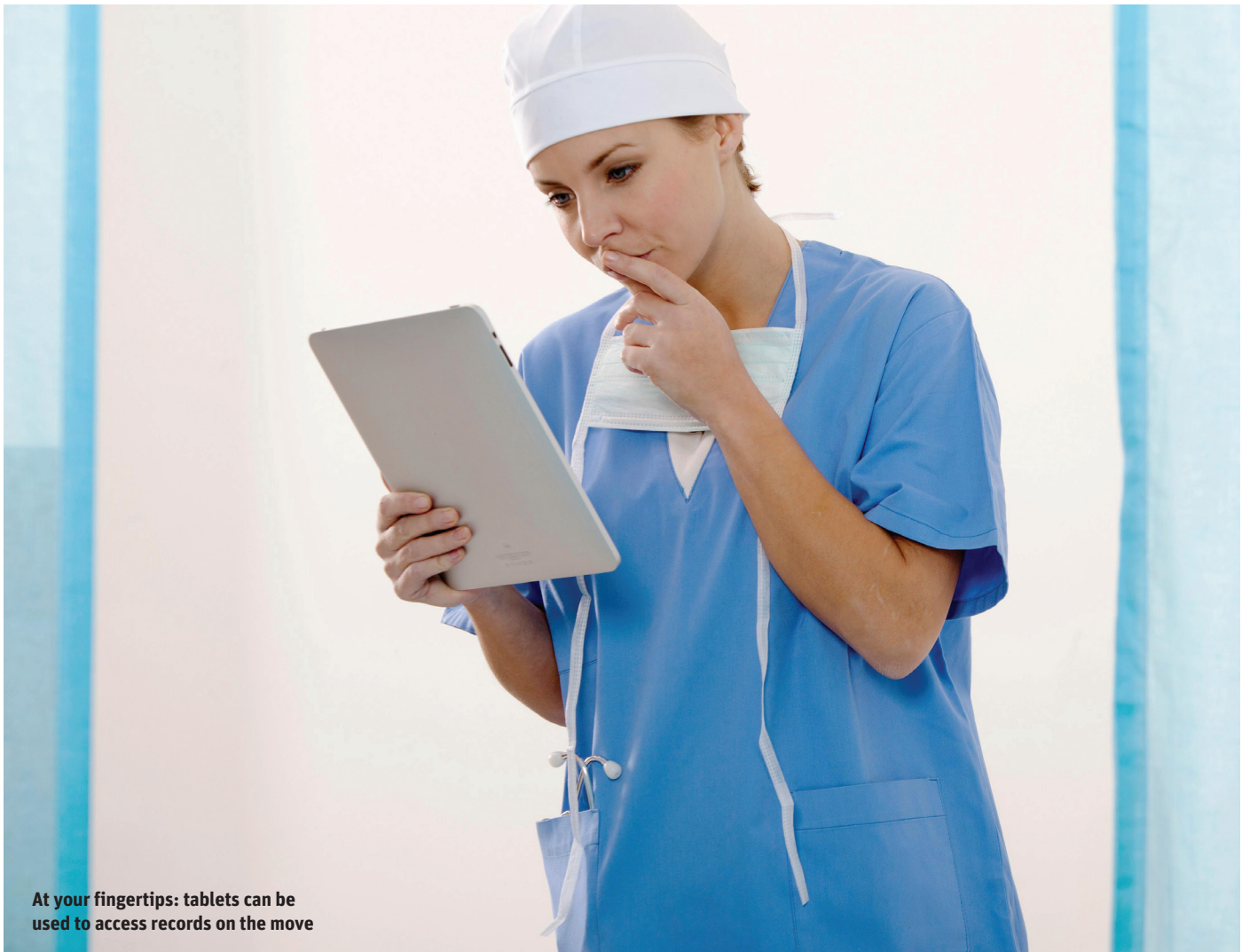
At your fingertips: tablets can be used to access records on the move

outcomes of care, including saving lives.”