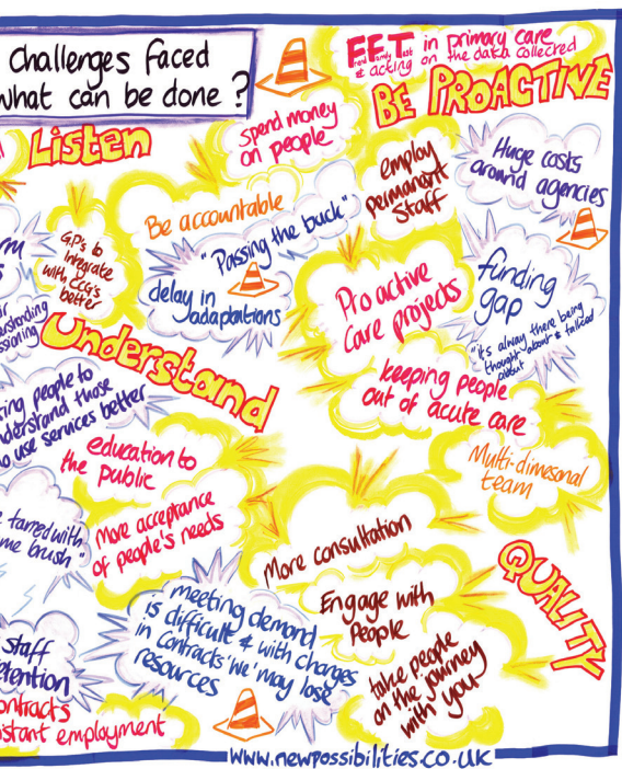
Taking workforce seriously: Commissioners spelt out their biggest challenges and suggested solutions, many of which related to workforce

Commissioning Strategy Programme Office, which brought in Skills for Health to develop a healthcare assistant package to standardise skills, training and knowledge across six boroughs of the capital.