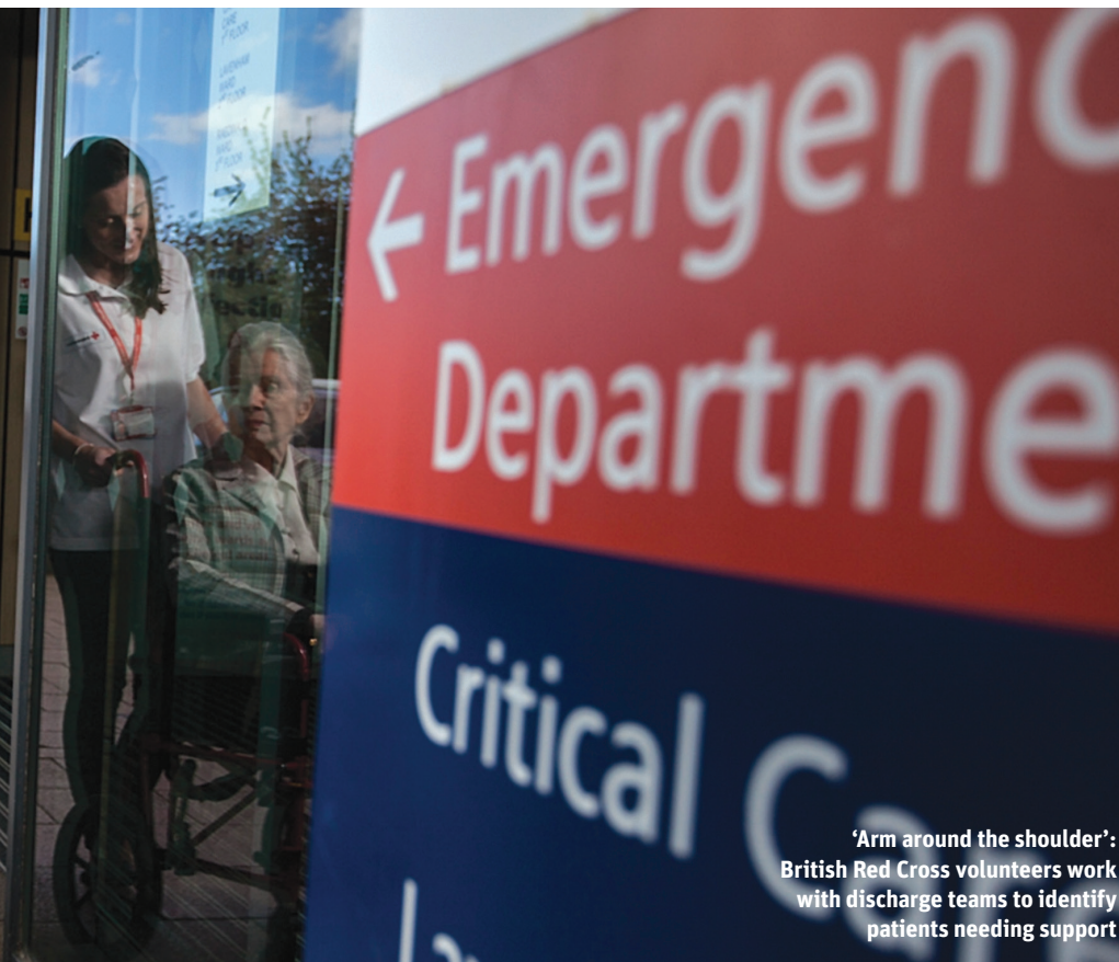
'Arm around the shoulder': British Red Cross volunteers work with discharge teams to identify patients needing support